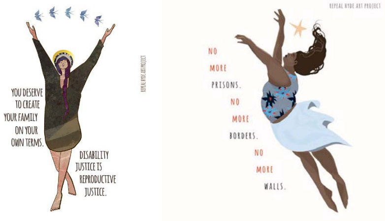
Figure 1 a and b. Images by Megan Smith, Repeal Hyde Art Project (Smith n.d.).

borders or walls, which encompasses prison abolition and immigration justice (see Figure 1b).