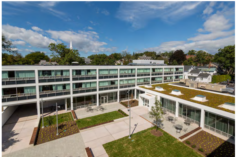
The refurbished Ziskind showing the sedum roof above the dining hall and the redesigned courtyard

On campus the process of regeneration and renewal of the buildings continues. A two-year renovation of Cutter and Ziskind, home to many Diploma students over the years, has been completed, with energy-efficient features, such as a roof planted with sedum. Dawes House, where several Diploma students lived in the 1960s when it was a graduate student residence (known as 8 Bedford Terrace), and where the French-speaking Diploma students often lived since 1977 after it became the French House, closed its doors as a dorm in June 2014. The announcement of this on our FB page elicited comments such as “heartbreaking,” “very sad,” “loved every moment at Dawes House.” Nos 12 and 26 Bedford Terrace, where Diploma students have also lived, closed as well. These closures are part of Smith’s $20 million budget reduction plan, brought on by the global economic downturn and adopted in 2009, which called for the reduction of the college’s use of space by 5 percent.