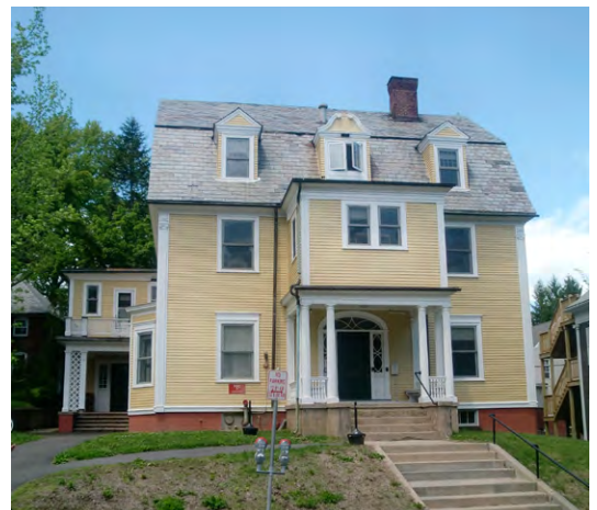
Dawes House, 8 Bedford Terrace, which closed as a dorm in 2014