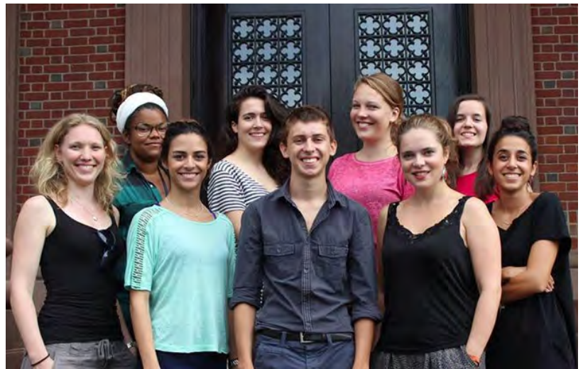
Nine of the 2015 group of Diploma students