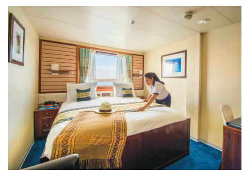
Comfortable Category 4 cabin.

Cabins and suites face outside with large windows and feature twin beds that convert to a queen. With private facilities, climate control, nightstands, desk, and storage. Seven sets of cabins with a connecting door and nine solo cabins.