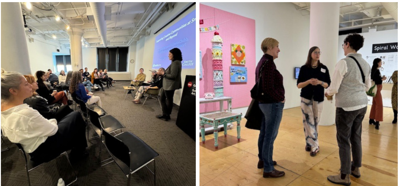
The Chicago Smith Club event Supporting Creative Communities at Smith and Beyond , 2025.