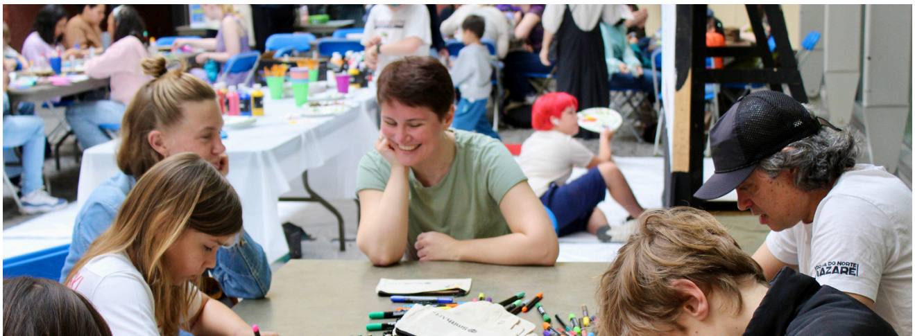
Smith Arts Day, 2025.