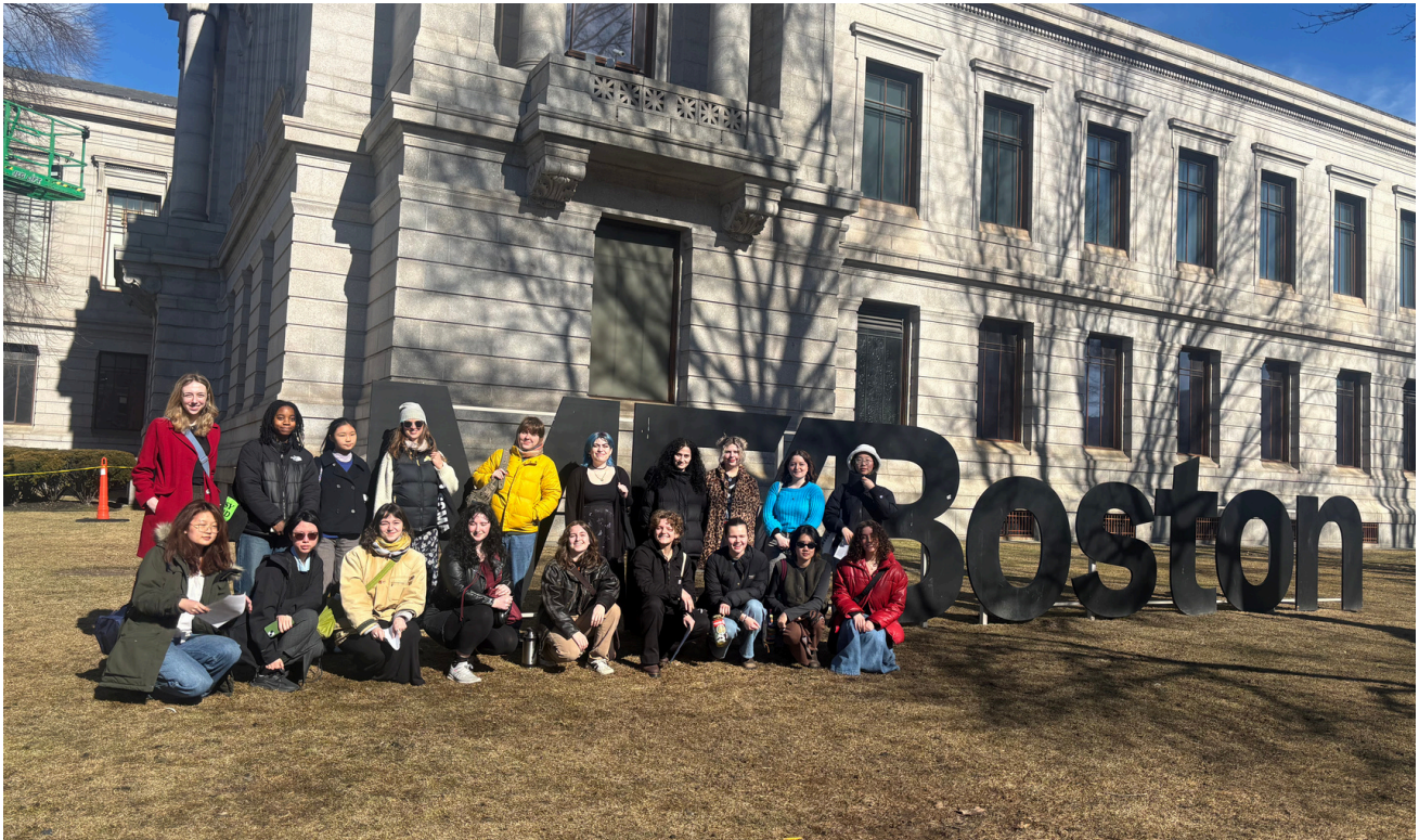
Boston Arts Career Trek, 2025.