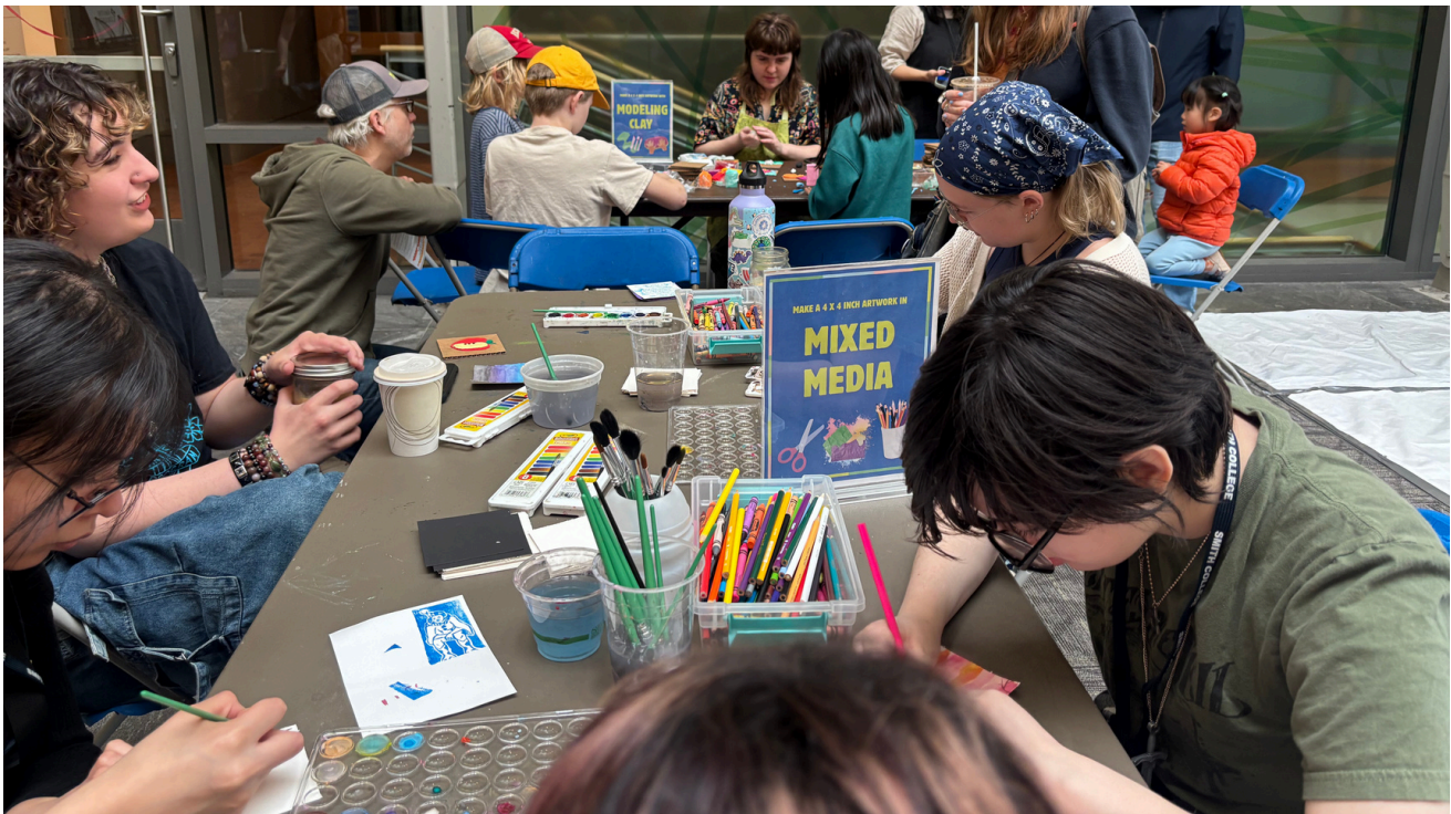
Smith Arts Day, 2025.