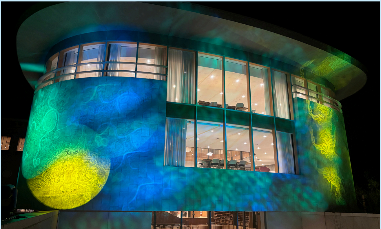
Neilson Library, illuminated in honor of Smith Arts Day, 2025.