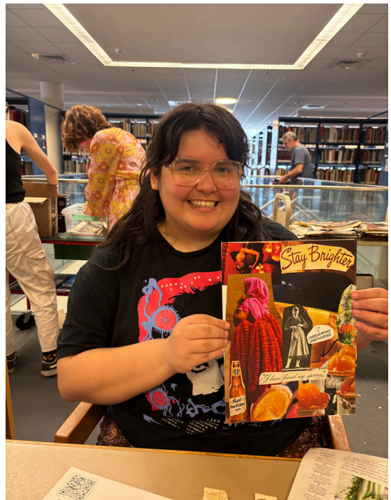
Smith Arts Day, 2025.