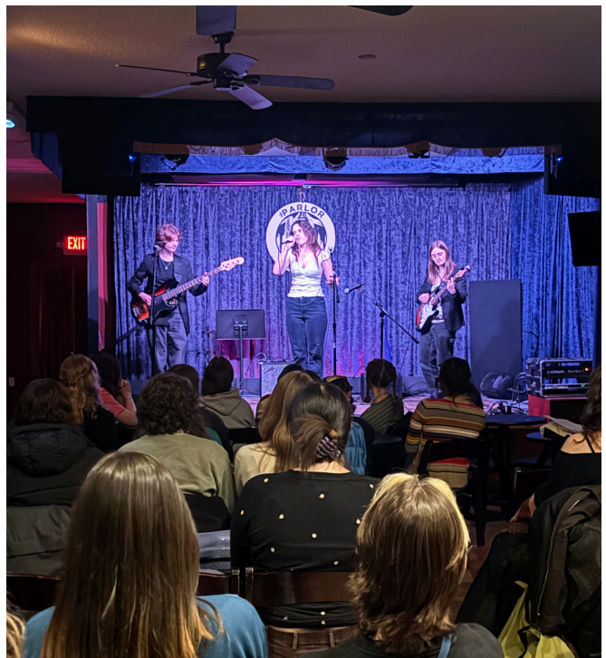
Clockwise, from top left: Students with Tourmaline, 2024 Cromwell Day keynote speaker, second from left; students performing at a Parlor Room Open Mic event; student vendor at the winter Student Art Sale.