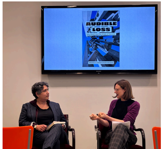
Clockwise, from top left: Do Plants Know Math? , Earth Music Theater Live, Audible Loss book release, BODY FREEDOM FOR EVERY(BODY) mobile exhibition.