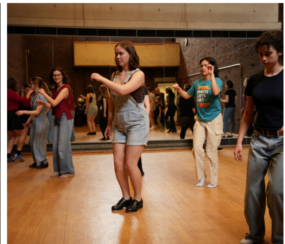
Smith Arts Day, 2025.