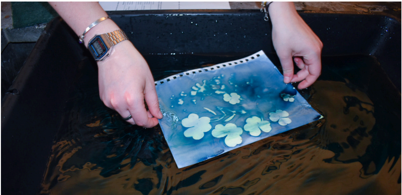
Student making a cyanotype during Smith Arts Day, 2025.