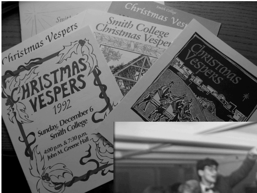
A Collection of Vespers programs, early 1990s