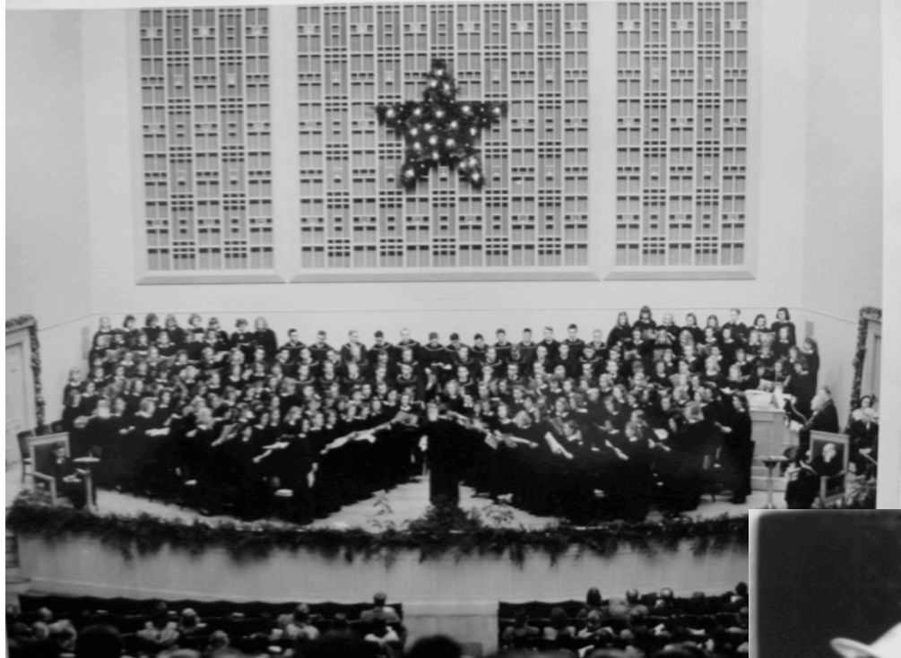
Christmas Vespers, Undated feat. Amherst College Glee Club