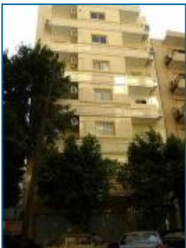
THE ILI DOKKI RESIDENCE

In both residences, each study bedroom is equipped with a bed, wardrobe, desk & chair, safe, armchair, and side tables. Each apartment has a kitchen, stores, washing facilities, dining and sitting rooms, cable TV, and internet access.