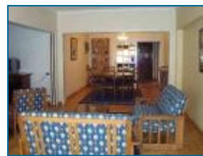
THE ILI RESIDENCE

One of the distinguishing factors about ILI is the state of the art facilities it provides for students. Situated strategically to allow for easy access to the city, the ILI building has 18 air-conditioned classrooms, the café and restaurant, a student library, and a study room/ internet center. The building has been recently refurbished.