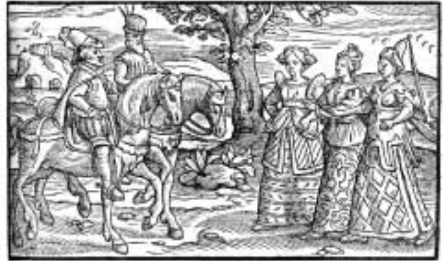
Woodcut of Macbeth and Banquo meeting three strange women, from Holinshed's Chronicles (London, 1577).