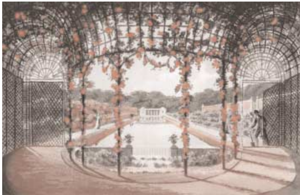
A British flower garden from Humphry Repton's Observations on the Theory and Practice of Landscape Gardening (London, 1803). The volume is described on page 4.