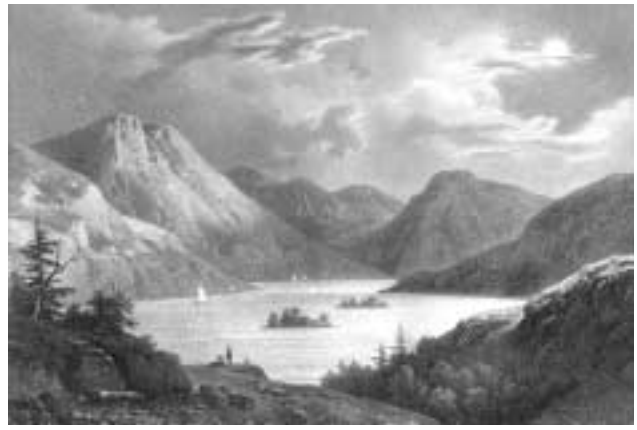
Lithograph of Loch Awe in Scotland from Vues pittoresques de l'Ecosse by F. A. Pernot (Paris: Charles Gosselin et Lami-Denoizan, 1826).

decorative initial letters, many spilling out into the page margins. Wide gold-leaf bands embellished with exuberant plant, animal, and insects motifs and small scenic miniatures frame the opening folios of each main division of the text. The facsimile is accompanied by a volume of essays on the history of the manuscript, its religious and paleographic aspects, and the nature of sixteenth-century patronage.