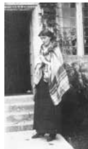
VIRGINIA WOOLF, 1923