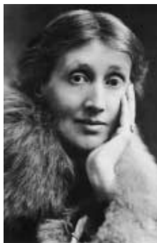
VIRGINIA WOOLF, 1927