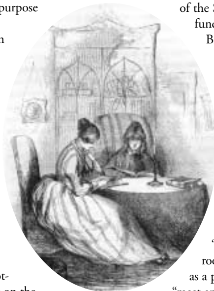
“Midnight Readings,” a woodcut from The Parish-side (New York: Mason Brothers, 1854).