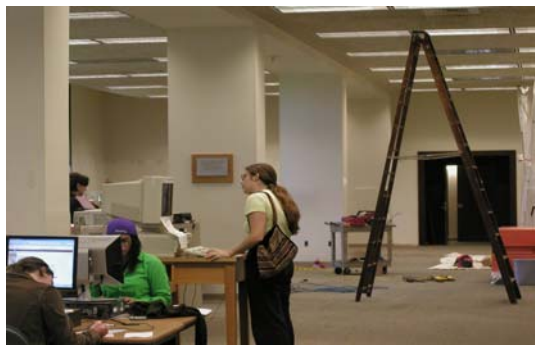
Mair Room renovation

In almost all disciplines, technology is playing an increasingly important role in teaching, learning and discovery. Faculty members have new expectations for student learning and students themselves work in different ways. The Information Commons establishes a continuum of services and resources to