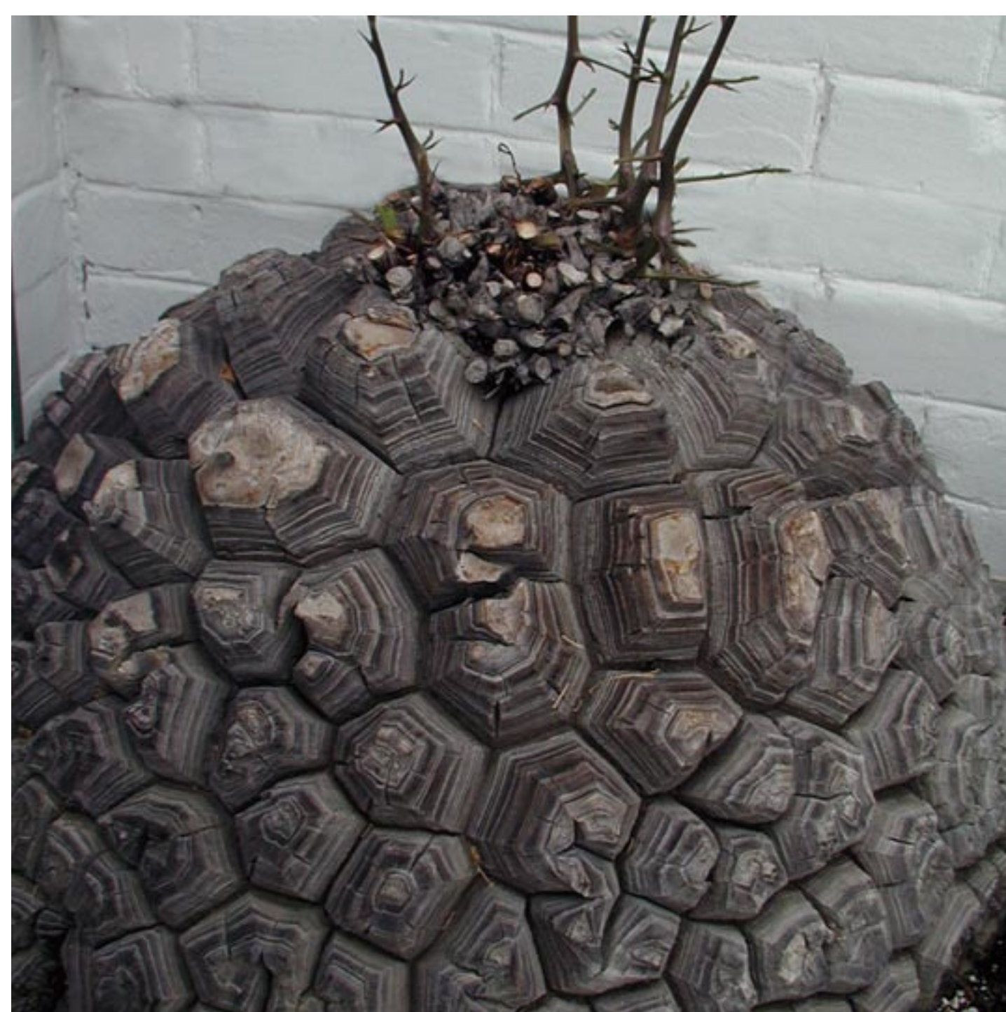
Tuberous root of elephant's foot

Dioscorea elephantipes , a South African yam known as elephant's foot , is one of many plants that have a large water storage organ. The leafy, green vine grows out of the yam during the rainy season. Upon drought, the stems die back and the leaves drop off, leaving the corky, brown, tuberous root that conserves food and water for the next growing cycle.