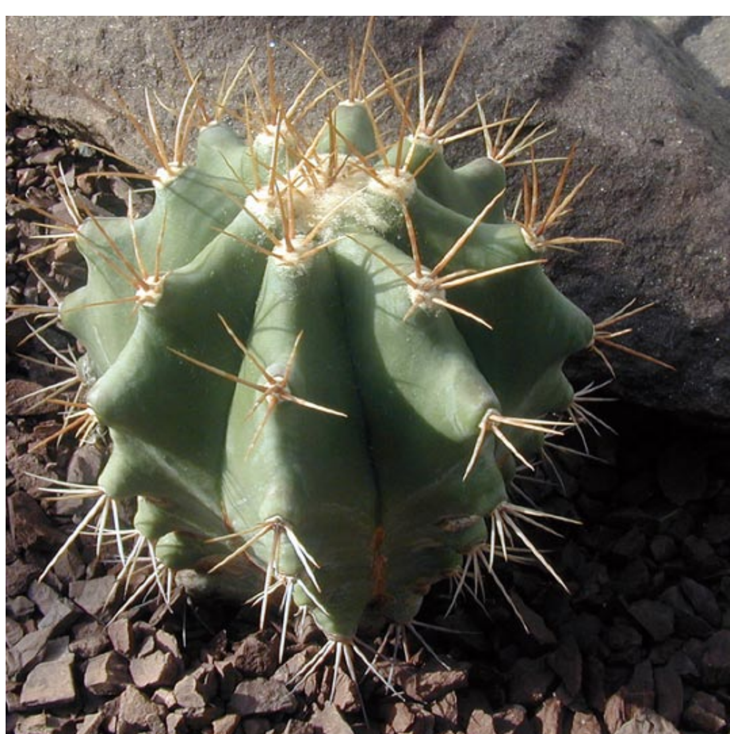
Spiny stem of Echinocactus grandis

Dioscorea elephantipes , a South African yam known as elephant's foot , is one of many plants that have a large water storage organ. The leafy, green vine grows out of the yam during the rainy season. Upon drought, the stems die back and the leaves drop off, leaving the corky, brown, tuberous root that conserves food and water for the next growing cycle.