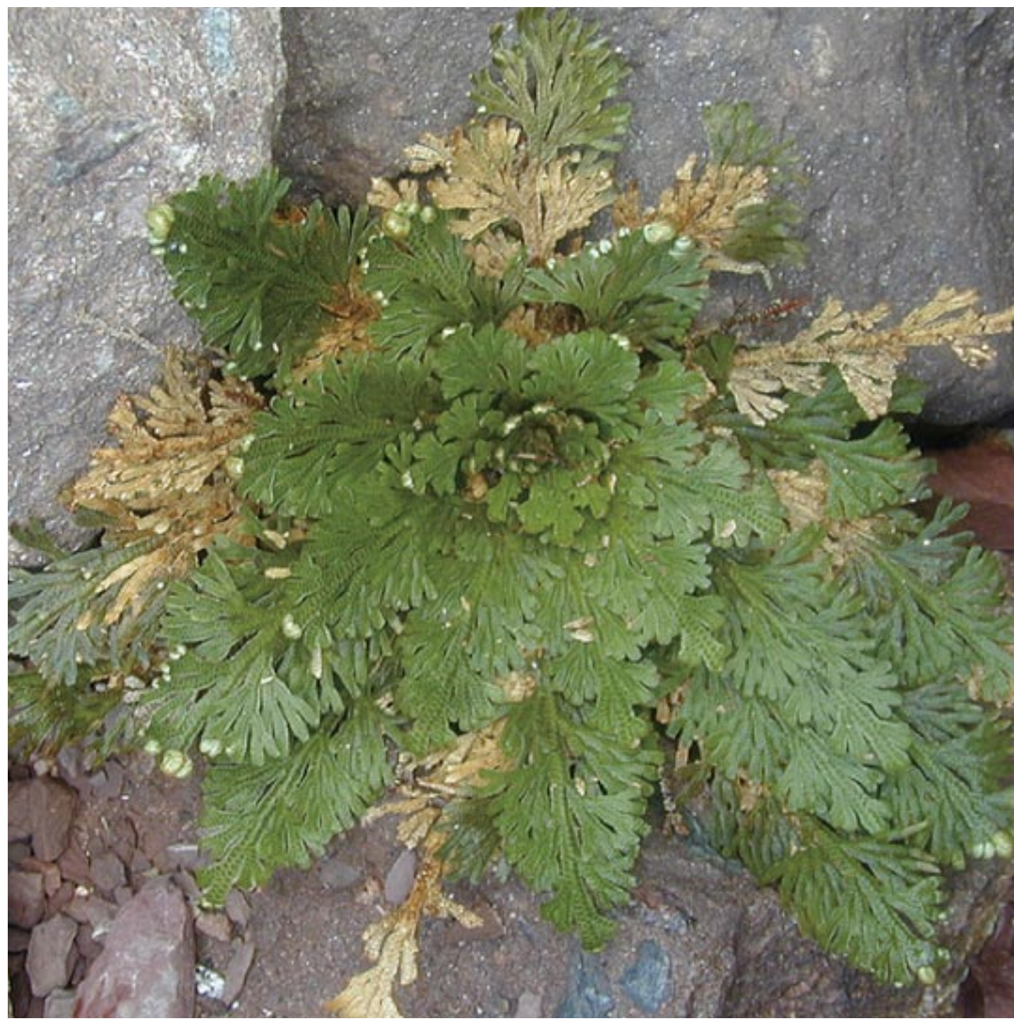
Resurrection plant after rain

Drought-tolerant plants have adaptations enabling them to live in dry environments. Such adaptations are essential since plants are composed mostly of water. One adaptation is to store water in enlarged organs. Another is to prevent water loss from the leaves or stems. Some plants cease growth or drop their leaves during dry periods.