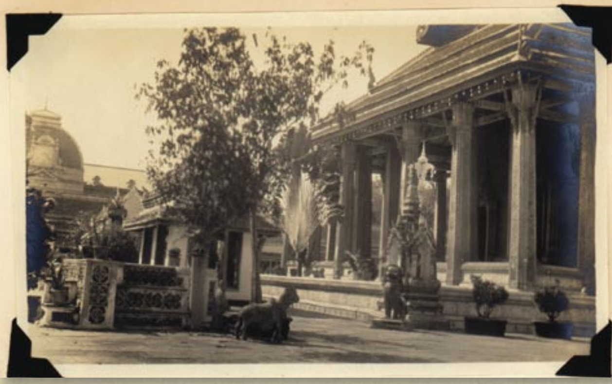
Court in Wat Phra Keo.