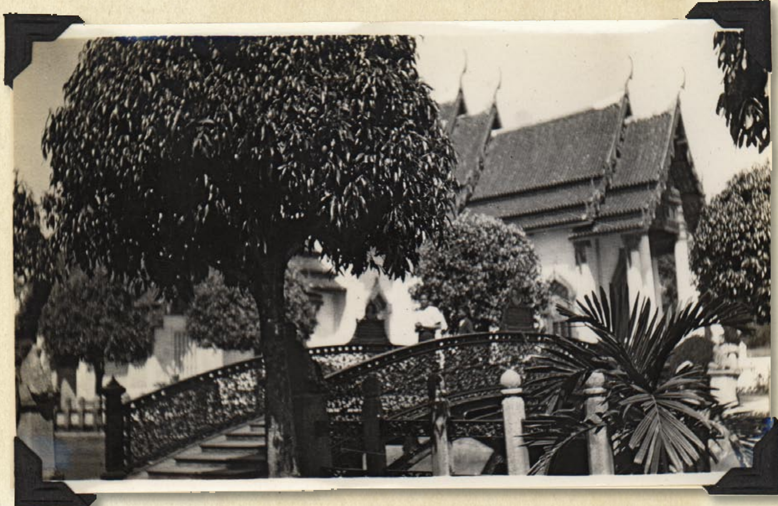
[Wat Arun, Bangkok] A curved bridge leads over a small canal to the rest of the temple buildings, and ficus and palm trees are to be found in the courts. The priests used this canal for bathing purposes.

Traveling through Siam, now known as Thailand, Elizabeth Roys concludes that the only authentic Siamese gardens are found surrounding the country's many Buddhist temples, or wats . An influx of Europeans and an embrace of Western "progress" had too strongly shaped the gardens of the wealthy in Bangkok, while the rural gardens of the poor, if they existed at all, consisted only of modest vegetable patches.