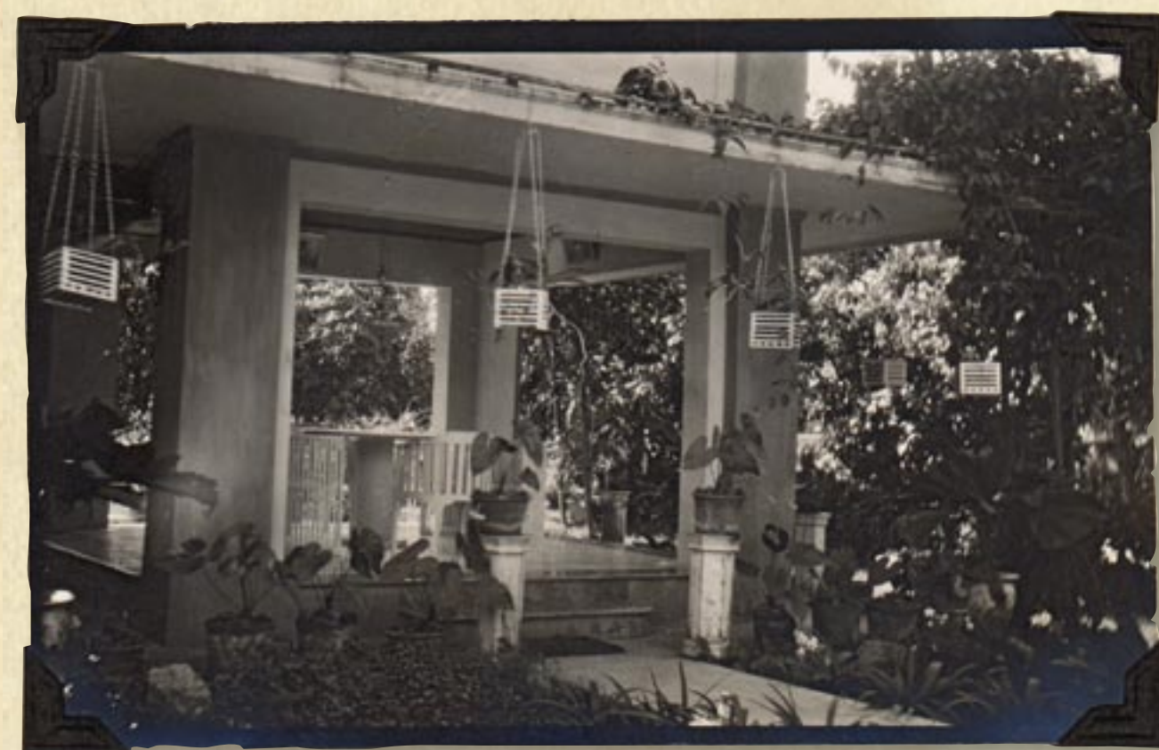
[Postcard] A corner of the town house of Prince Damrong, the Prime Minister, showing the pergola built in the garden. This can be easily seen to be entirely foreign to anything Siamese, though very attractive in itself. I did not take a picture of the house—it was too discouraging to one looking for the typically Siamese.

In Bangkok Roys visited the famous Wat Phra Keo, or Chapel of the Emerald Buddha and recorded her impressions of the Wat Arun, or Temple of the Dawn. She also carefully investigated the temples of northern Siam, including the Wat Phrathat Doi Suthep,