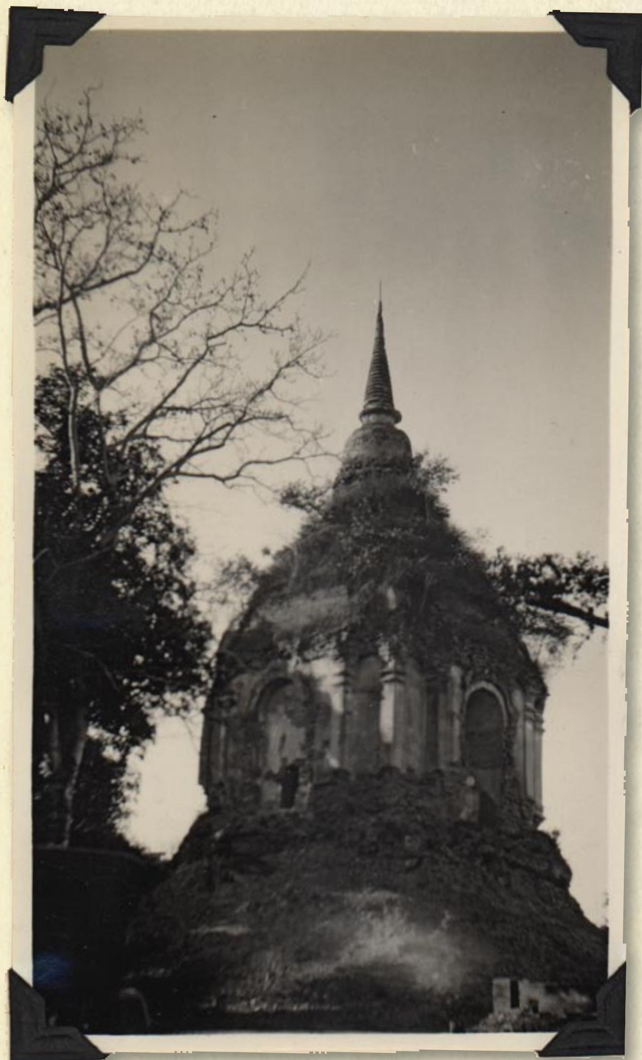
One of the numerous old stupas to be found in ruined condition throughout the country-side in Siam. This one was found in the fields north of Chiangmai, nothing left of the temple but a pile of rubbish and the spire of the stupa.

Roys underscores the importance of Buddhism to Siamese culture and records the great number of wats dotting the landscape. She describes their prevalent coating of gleaming white stone and stucco set off by black lacquered windows and doors, brilliantly colored roof tiles, and the shade of fig trees. No flowers appear. Instead, courtyards are adorned with venerable old trees, clipped shrubs, rockeries, figures of lions, horses, and elephants, and many statues of the Buddha. Numerous highly decorated stupas , or small pagodas, contain the ashes of the dead.