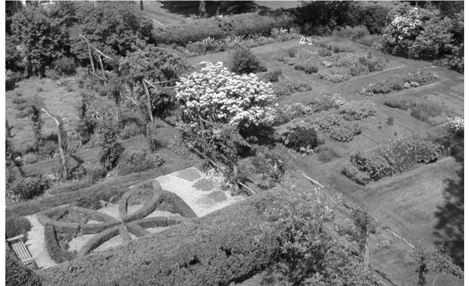
Aerial view of Capen Garden in June of 2001

The renovation of Capen Garden is intended to make the garden more functional and provide better access to the public. Landscape architect Nancy Denig (class of 1968), of Denig Design Associates in Northampton, has done a great job solving ongoing problems with the garden and adding elements that will increase the visibility and utility of the space. The new design features stone and metal entrance gates, one at the west side of Capen House and one on Prospect Street. A large water fountain will grace the new “classroom,” which will be a series of artfully arranged granite ledges on the edge of the garden. Other improvements are the realignment of the Jill Ker Conway Gazebo with the central axis of the garden rooms, the addition of a place to exhibit sculpture (student work rotated one per year), more educational labeling, additional trellises, and barrier fences to hide the work areas from view.