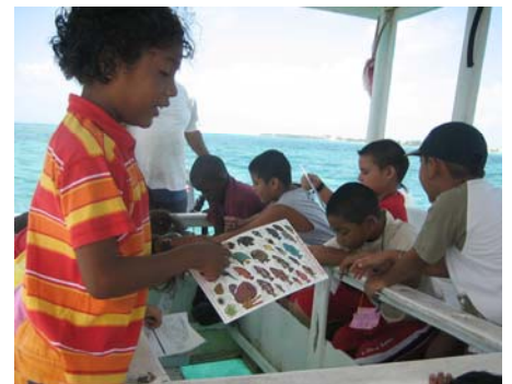
Identifying sea life: glass-bottom boat ride.

This year, a new event was developed called "Experiment Day." Each Smith student teacher ran a sta-