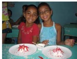
A favorite project is making edible coral polyps.

The Smith students in the Coral Reef EdVentures program ran camp for three weeks total: one week of "advanced" camp, for children who had been in the program previously, and two weeks of the regular program, which was designed for ages seven to eleven.