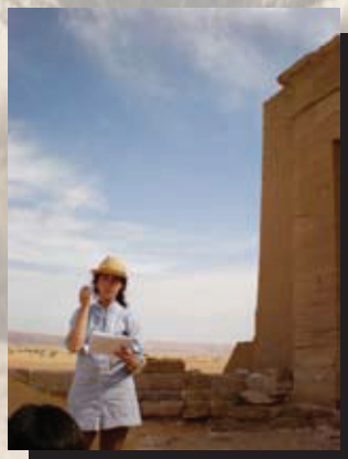
Student giving presentation

The field component involves you in the excavations taking place in Amheida, ancient Trimithis, once a bustling town at the edge of the Roman Empire. Its goal is to provide you with the opportunity to participate in numerous facets of a scientific, state-of-the-art excavation. The Nile Valley study seminar offers a broad exposure to the archaeology of Egypt through visits to sites and museums from Aswan to Alexandria, so that you are better able to place the oases in their greater Egyptian and Roman contexts. Finally, there is a 4 credit independent research project due at the end of the academic term.