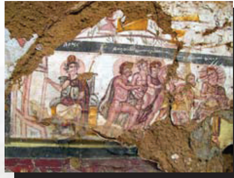
Roman wall paintings excavated in the first season at Amheida

Your time in Egypt is divided into three components, each a course for credit: the oases seminar, the field component, and the traveling seminar. The oases seminar focuses upon the archaeology, society, economy, and culture of the oases of the Western Desert of Egypt.